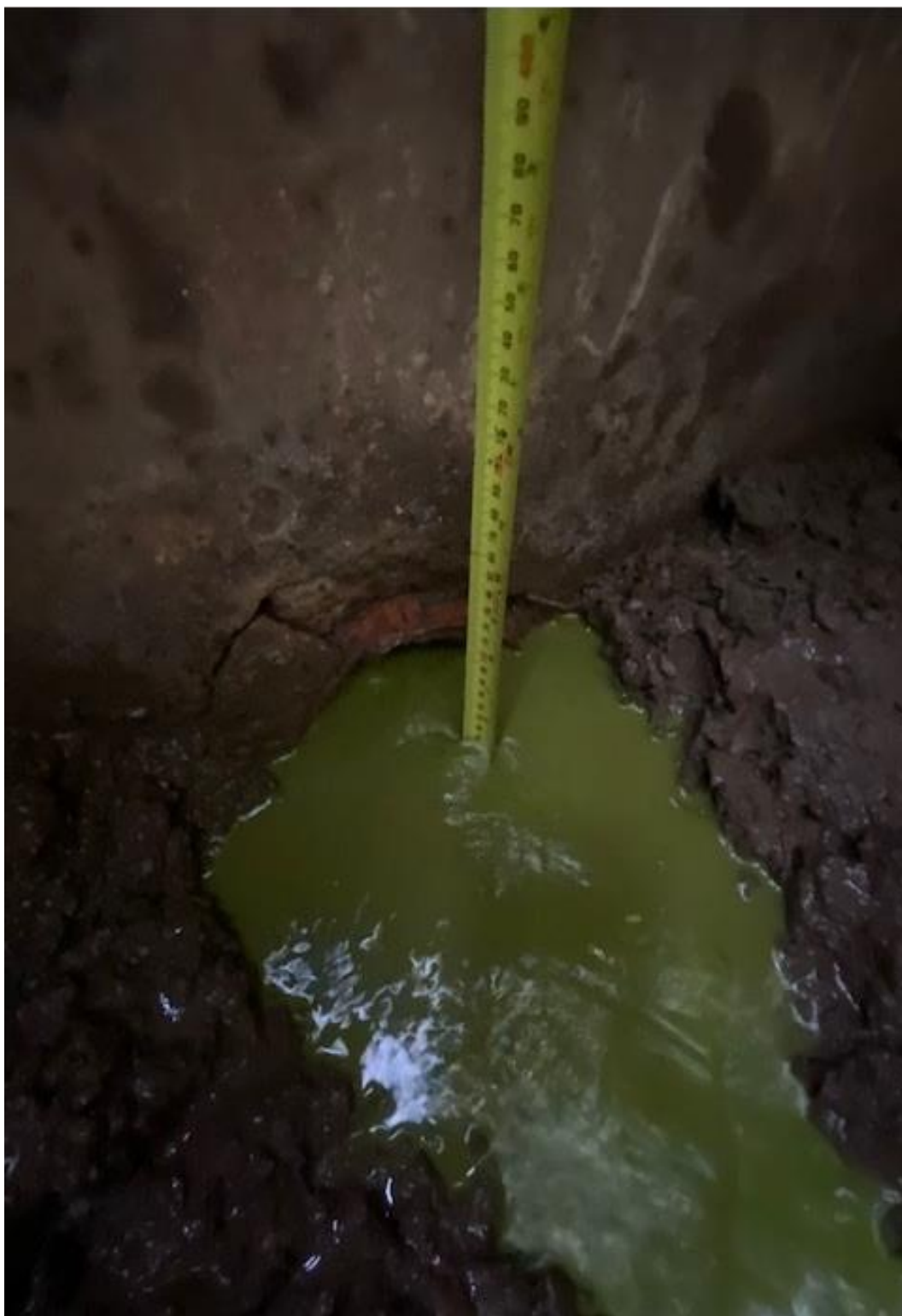
The existing 225mm stormwater pipeline continuing downstream through to Marion Street. Refer to the attached photos.